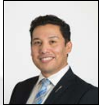
Hon. Ricardo Miranda Minister of Culture and Tourism