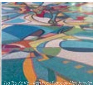
Tsa Tsa Ke Ke – Iron Foot Place by Alex Janvier