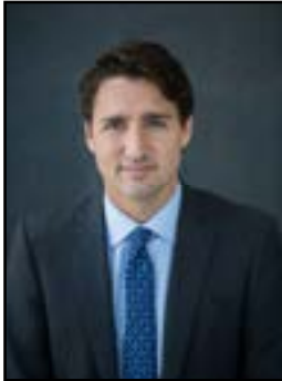
Rt. Hon. Justin Trudeau Prime Minister of Canada

I am delighted to extend my warmest greetings to everyone attending the 2016 Dreamspeakers International Indigenous Film Festival: “A New Reel,” which is being held at the Garneau Theatre.