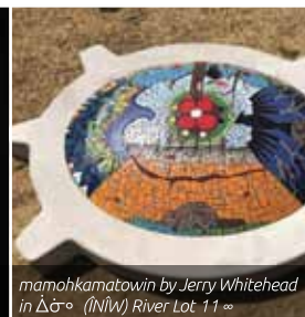
mamohkamatowin by Jerry Whitehead in ᐃᐱᐱᐱ (INW) River Lot 11